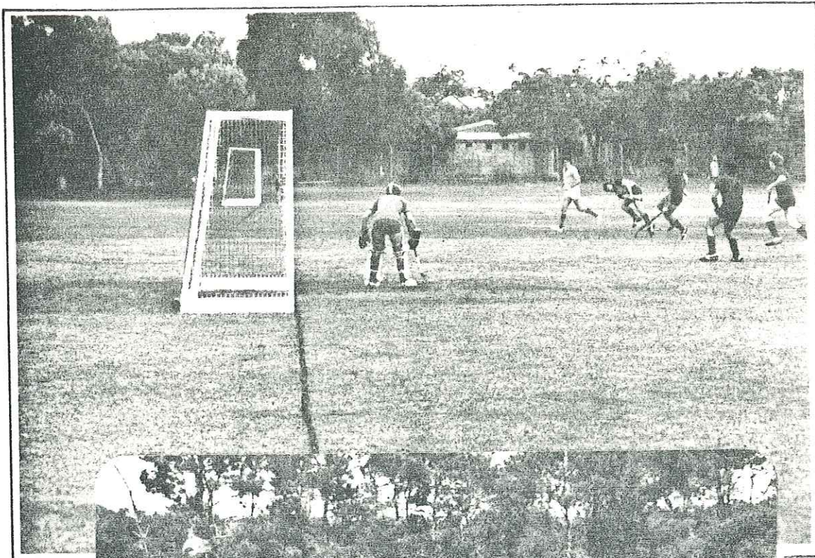
Goal coming up for Kevin Allen in the Res. Blue Semi Final.